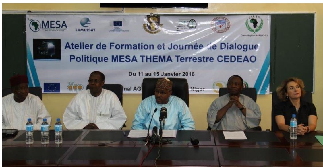
High table :From right to left : the EU representative, ECOWAS representative, Minister of livestock, CILSS Executive Secretary, the technical chief of Niger Minister of State Minister of Agriculture