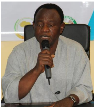
The ECOWAS representative