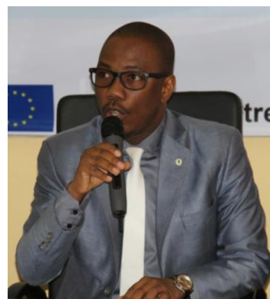
The ARC Director General