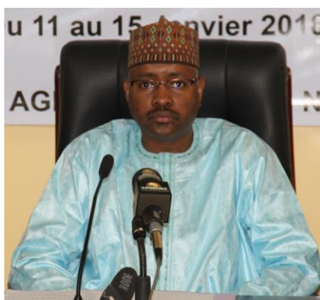
The Minister of Livestock